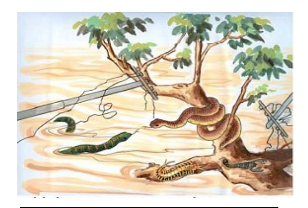
Note that the animals in the flood hazard