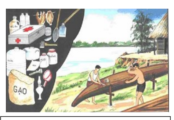
Food Storage for the family, drugs and instruments necessary

Stockpile firewood, water, food, fodder for animals