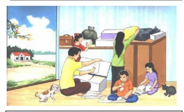
remove the said valuables to higher indoor