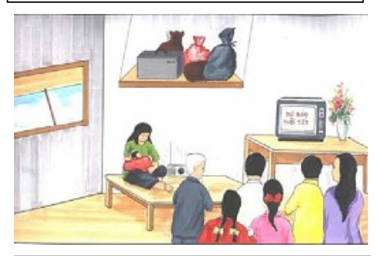
access to information about weather conditions every day