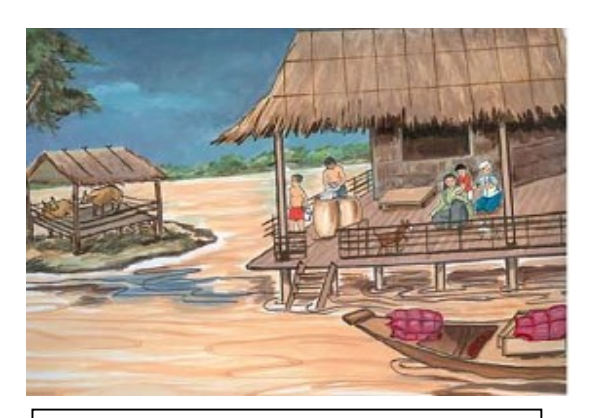
keep children from falling into the water

reserves and access to clean water and eat cooked